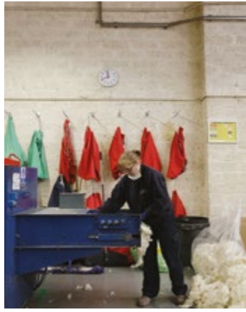
CUT AND SEW

Unlike others, Vispring only use raw materials to make their beds. Nothing is bought in from a third party. In the industry it's known as cut and sew – every component (including the vanadium steel springs in the mattresses) is made by Vispring. And it's at this stage that the cut and sew team get to work preparing all the raw materials for the bed construction – anything from hand-teasing wool to steaming horsehair to make it even softer.